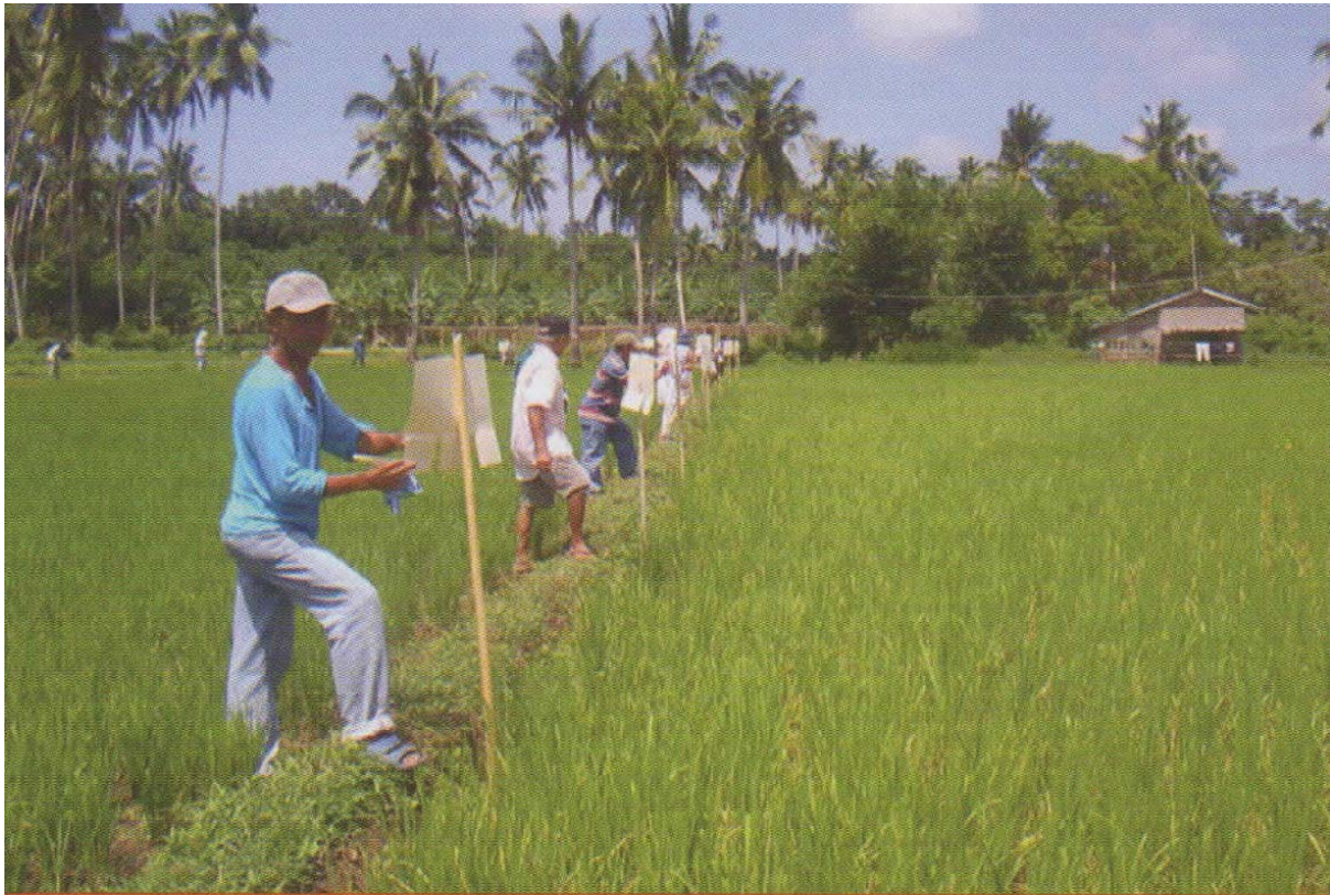
CASANDRO ARC, a rice producing area, with its farmers/ARBs shown being provided various rice-related and hands-on trainings.

With its launching, the community hoped for a better life.